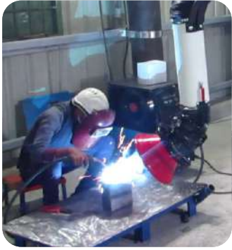
Fume & Smoke Extraction